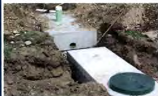
Water Quality Improvement Projects