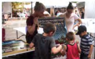
Stormwater Education Campaign Activities