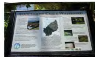
"Your Goose Creek Watershed" Signs