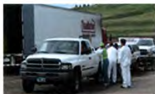
Hazardous Household Waste Collection Days