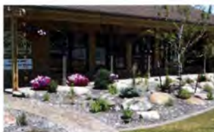
Rain Garden/Run-off Demonstration Project