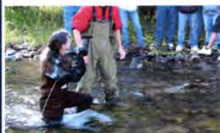
Goose Creek Monitoring, Planning, and TMDL

SCCD has partnered with the City of Sheridan for several years to address water quality issues as well as other programs. Since 2001, SCCD has provided assistance on 62 water quality improvement projects within the Goose Creek watershed, upstream of the City of Sheridan; including, 16 livestock-related projects, 26 septic system replacements (including 4 connections to City sewer), 9 stream and/or diversion projects (including South Park and Kendrick Park), and 11 willow planting sites. Water quality monitoring on the Goose Creek watershed is conducted every three years and education efforts continue on an on-going basis. At the City's request, SCCD initiated a stormwater education campaign in 2016, which has included a variety of demonstrations and activities.